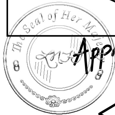
Kingdom of X by SL

Approved by Registrar of Lands of Jimmy Auckland