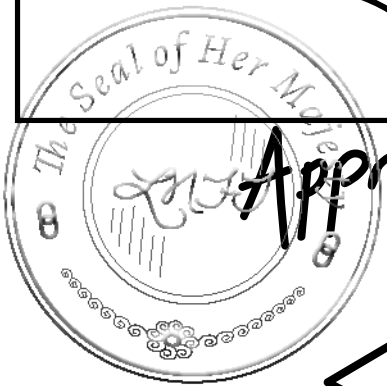
Kingdom of X by SL

Approved by Registrar of Lands of Jimmy Jimmy Auckland