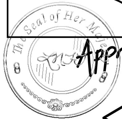
Kingdom of X by SL

Approved by Registrar of Lands of Jimmy Jimmy Auckland