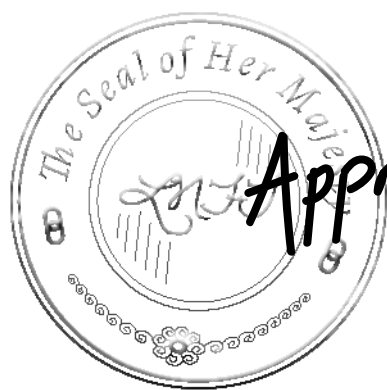
The Great Empire