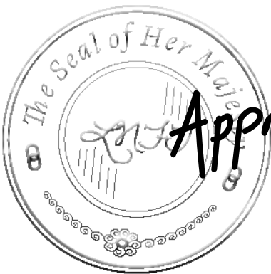
The Great Empire