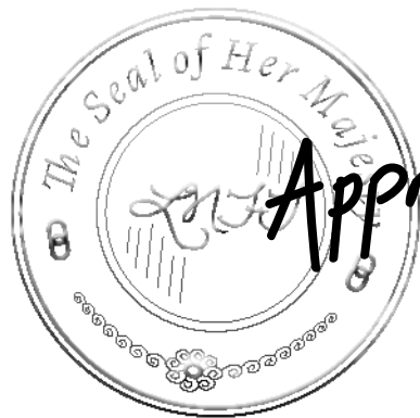
The Great Empire