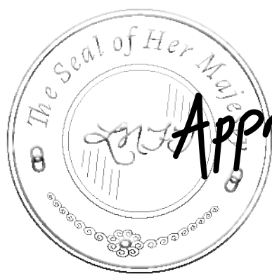
The Great Empire