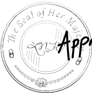
The Great Empire