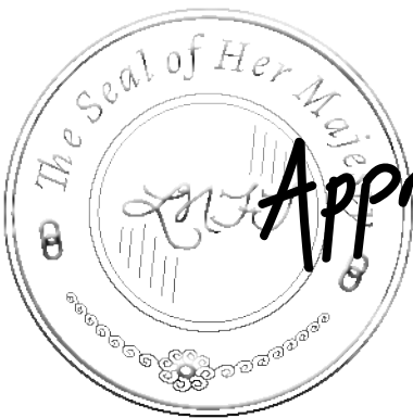
The Great Empire