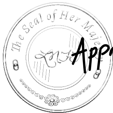
The Great Empire