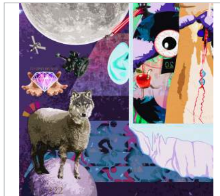
Photograph Inset of Work

I, the undersigned creator, certify that the work described herein is my own and that I produced the same as an original, authentic, and unique one of one creation. This work will not be duplicated nor reproduced for future commercial gain. I certify that the above information and statements are true and correct.