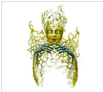
Photograph Inset of Work

I, the undersigned creator, certify that the work described herein is my own and that I produced the same as an original, authentic, and unique one of one creation. This work will not be duplicated nor reproduced for future commercial gain. I certify that the above information and statements are true and correct.