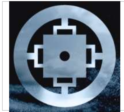
Photograph Inset of Work

I, the undersigned creator, certify that the work described herein is my own and that I produced the same as an original, authentic, and unique one of one creation. This work will not be duplicated nor reproduced for future commercial gain. I certify that the above information and statements are true and correct.