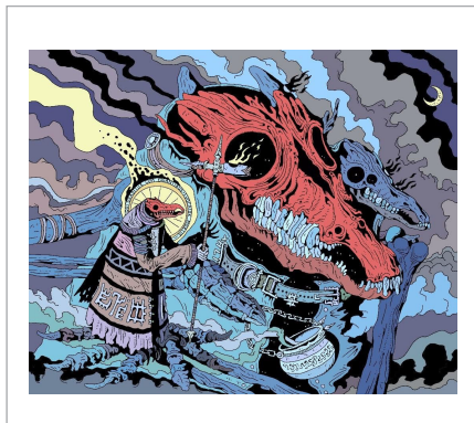
Photograph Inset of Work

I, the undersigned creator, certify that the work described herein is my own and that I produced the same as an original, authentic, and unique one of one creation. This work will not be duplicated nor reproduced for future commercial gain. I certify that the above information and statements are true and correct.