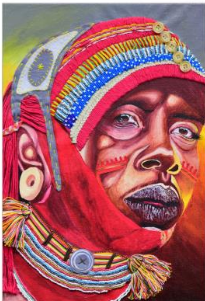
THE PEOPLE OF AFRICA The Mighty warrior - Samburu Tribe