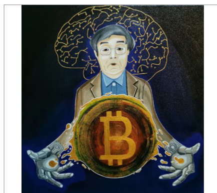
Photograph Inset of Work

I, the undersigned creator, certify that the work described herein is my own and that I produced the same as an original, authentic, and unique one of one creation. This work will not be duplicated nor reproduced for future commercial gain. I certify that the above information and statements are true and correct.