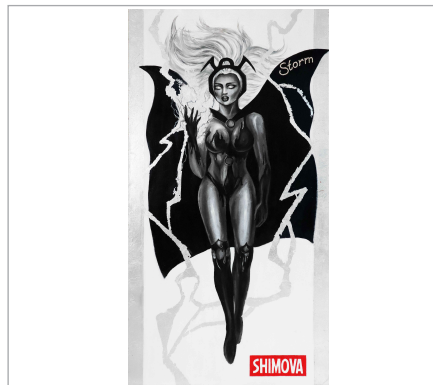
Photograph Inset of Work

I, the undersigned creator, certify that the work described herein is my own and that I produced the same as an original, authentic, and unique one of one creation. This work will not be duplicated nor reproduced for future commercial gain. I certify that the above information and statements are true and correct.