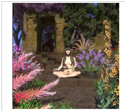
Photograph Inset of Work

I, the undersigned creator, certify that the work described herein is my own and that I produced the same as an original, authentic, and unique one of one creation. This work will not be duplicated nor reproduced for future commercial gain. I certify that the above information and statements are true and correct.