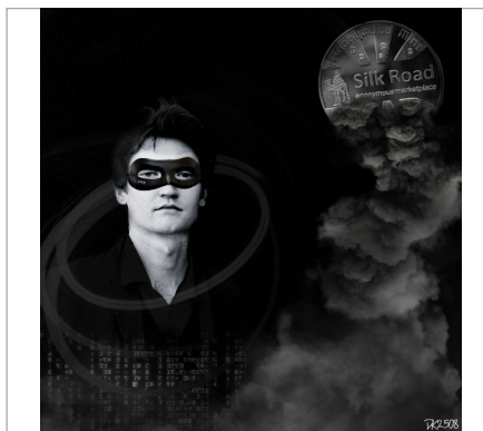
Photograph Inset of Work

I, the undersigned creator, certify that the work described herein is my own and that I produced the same as an original, authentic, and unique one of one creation. This work will not be duplicated nor reproduced for future commercial gain. I certify that the above information and statements are true and correct.