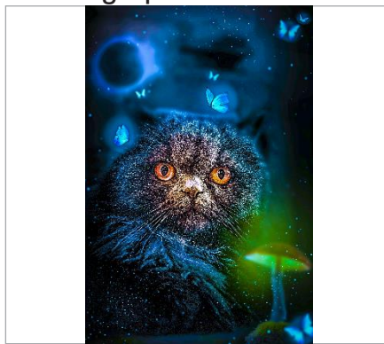
Photograph Inset of Work

I, the undersigned creator, certify that the work described herein is my own and that I produced the same as an original, authentic, and unique one of one creation. This work will not be duplicated nor reproduced for future commercial gain. I certify that the above information and statements are true and correct.