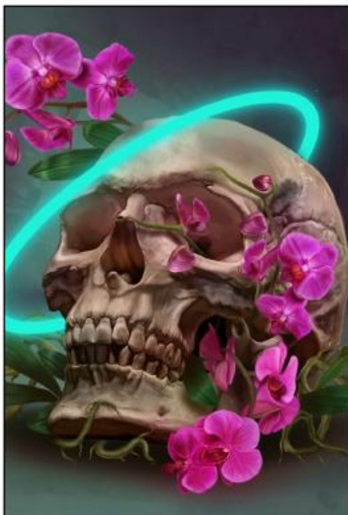
SKULL COLLECTION Neon Orchid