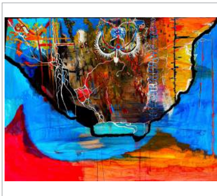
Photograph Inset of Work

I, the undersigned creator, certify that the work described herein is my own and that I produced the same as an original, authentic, and unique one of one creation. This work will not be duplicated nor reproduced for future commercial gain. I certify that the above information and statements are true and correct.