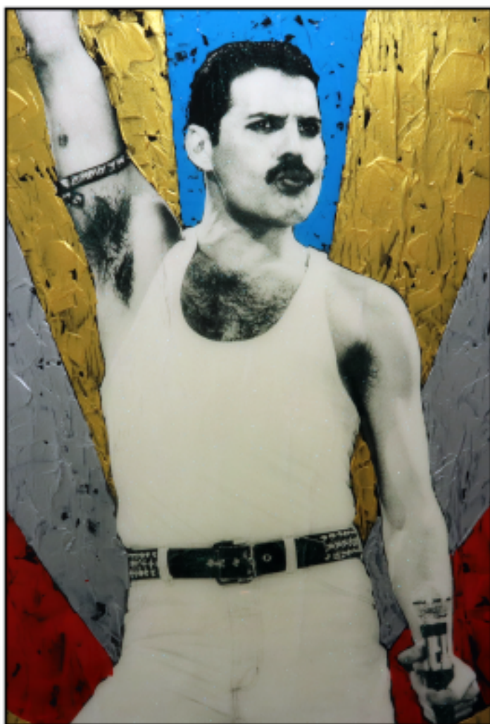
TIMELESS FRONT MEN Mercury Rising