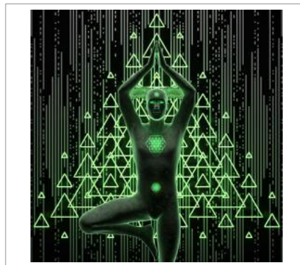
Photograph Inset of Work

I, the undersigned creator, certify that the work described herein is my own and that I produced the same as an original, authentic, and unique one of one creation. This work will not be duplicated nor reproduced for future commercial gain. I certify that the above information and statements are true and correct.