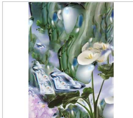
Photograph Inset of Work

I, the undersigned creator, certify that the work described herein is my own and that I produced the same as an original, authentic, and unique one of one creation. This work will not be duplicated nor reproduced for future commercial gain. I certify that the above information and statements are true and correct.