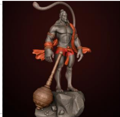
Photograph Inset of Work

I, the undersigned creator, certify that the work described herein is my own and that I produced the same as an original, authentic, and unique one of one creation. This work will not be duplicated nor reproduced for future commercial gain. I certify that the above information and statements are true and correct.