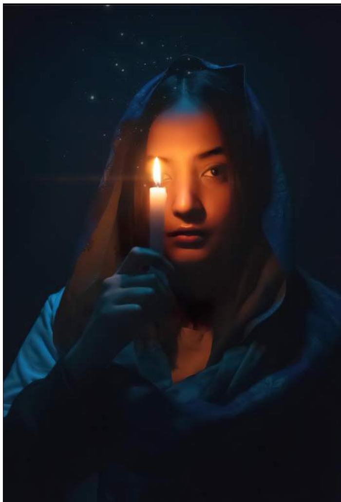
ONE THOUSAND WORDS Girl With A Candle In The Dark