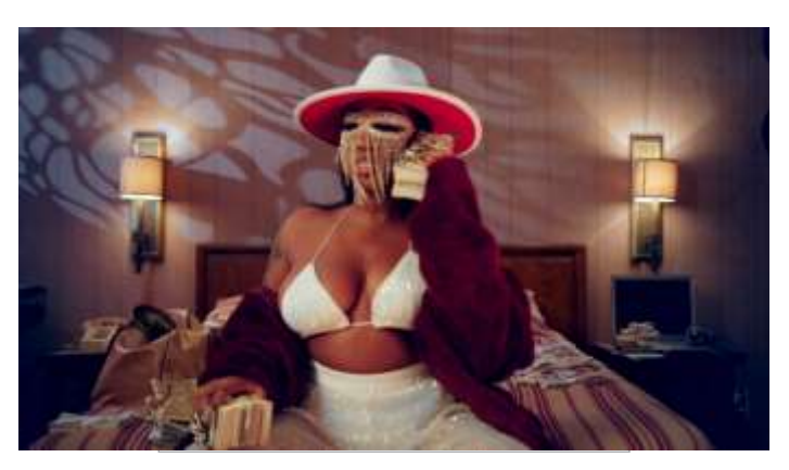
Photograph Inset of Work

I, the undersigned creator, certify that the work described herein is my own and that I produced the same as an original, authentic, and unique one of one creation. This work will not be duplicated nor reproduced for future commercial gain. I certify that the above information and statements are true and correct.