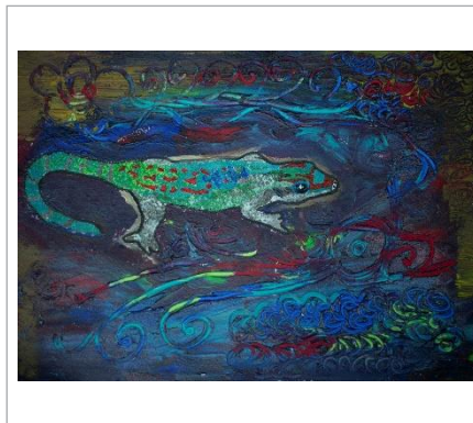
Photograph Inset of Work

Creator's Name: Shikha Baichoo Eisenberg