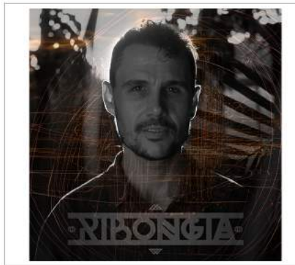
Photograph Inset of Work

I, the undersigned creator, certify that the work described herein is my own and that I produced the same as an original, authentic, and unique one of one creation. This work will not be duplicated nor reproduced for future commercial gain. I certify that the above information and statements are true and correct.