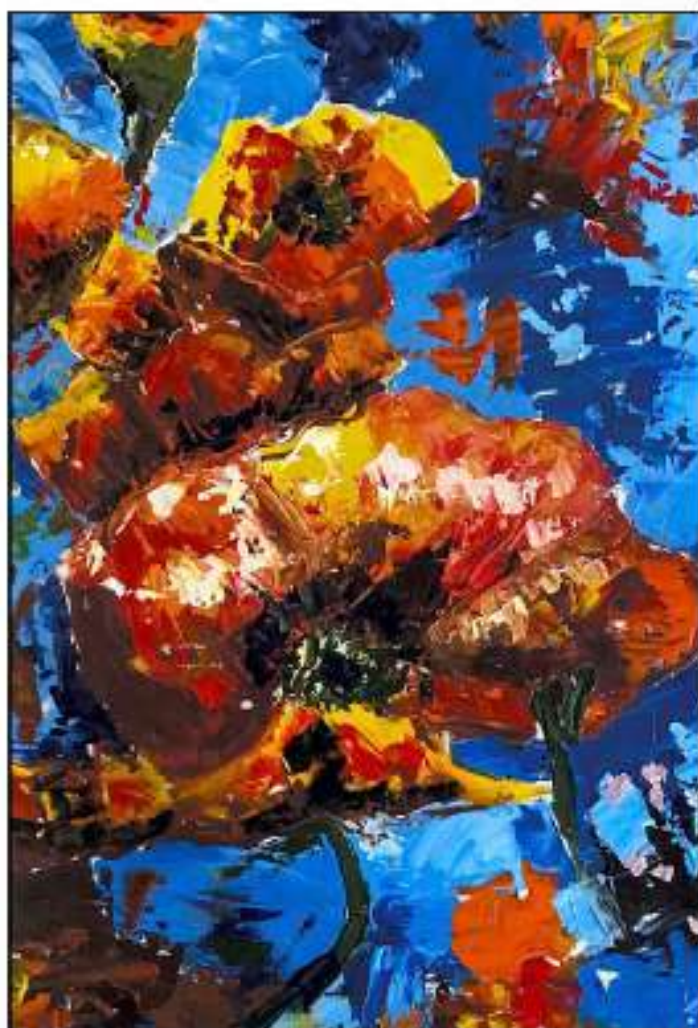
NATURALEZA Fiori Del Mare