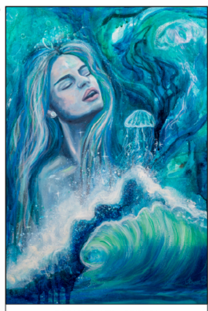
UNIVERSAL CONNECTION Ecstatic Flow