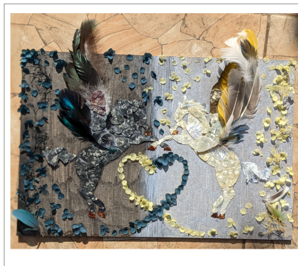
Photograph Inset of Work

I, the undersigned creator, certify that the work described herein is my own and that I produced the same as an original, authentic, and unique one of one creation. This work will not be duplicated nor reproduced for future commercial gain. I certify that the above information and statements are true and correct.