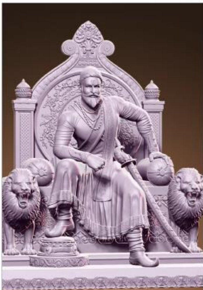
WARRIORS OF INDIA Chhatrapati Shivaji Maharaj