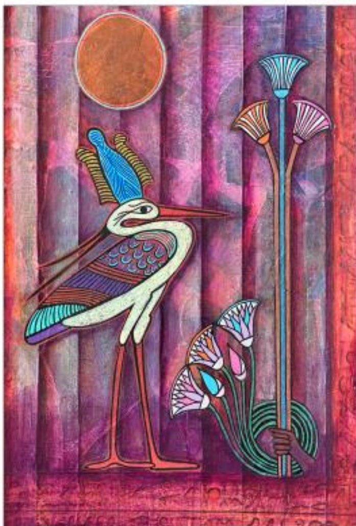
EGYPTIAN SYMBOLS Bennu Bird