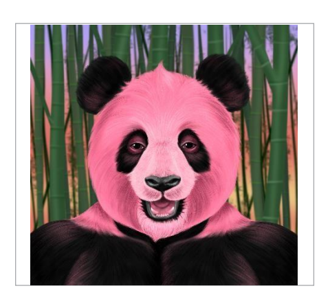
Photograph Inset of Work

I, the undersigned creator, certify that the work described herein is my own and that I produced the same as an original, authentic, and unique one of one creation. This work will not be duplicated nor reproduced for future commercial gain. I certify that the above information and statements are true and correct.