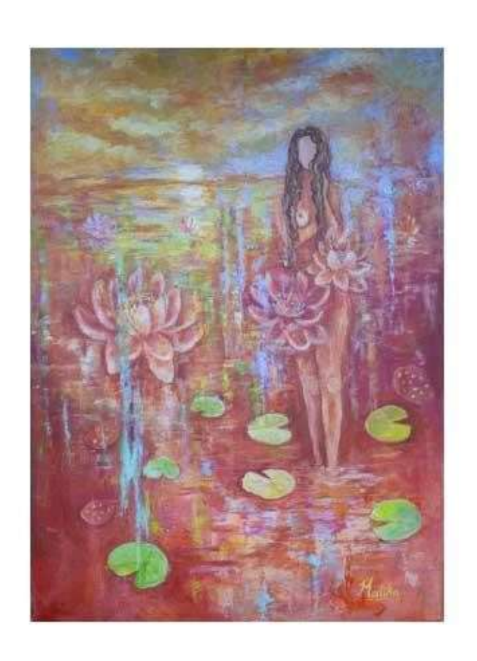
Malika Devi Dhurn-Teeluck