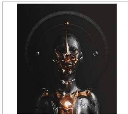
Photograph Inset of Work

I, the undersigned creator, certify that the work described herein is my own and that I produced the same as an original, authentic, and unique one of one creation. This work will not be duplicated nor reproduced for future commercial gain. I certify that the above information and statements are true and correct.