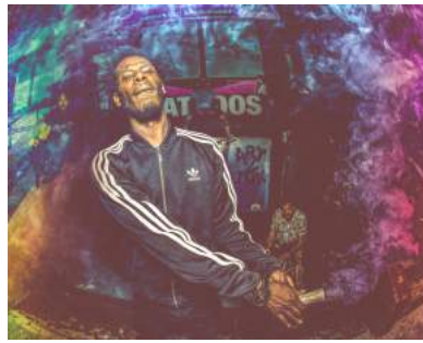
Photograph Inset of Work

I, the undersigned creator, certify that the work described herein is my own and that I produced the same as an original, authentic, and unique one of one creation. This work will not be duplicated nor reproduced for future commercial gain. I certify that the above information and statements are true and correct.